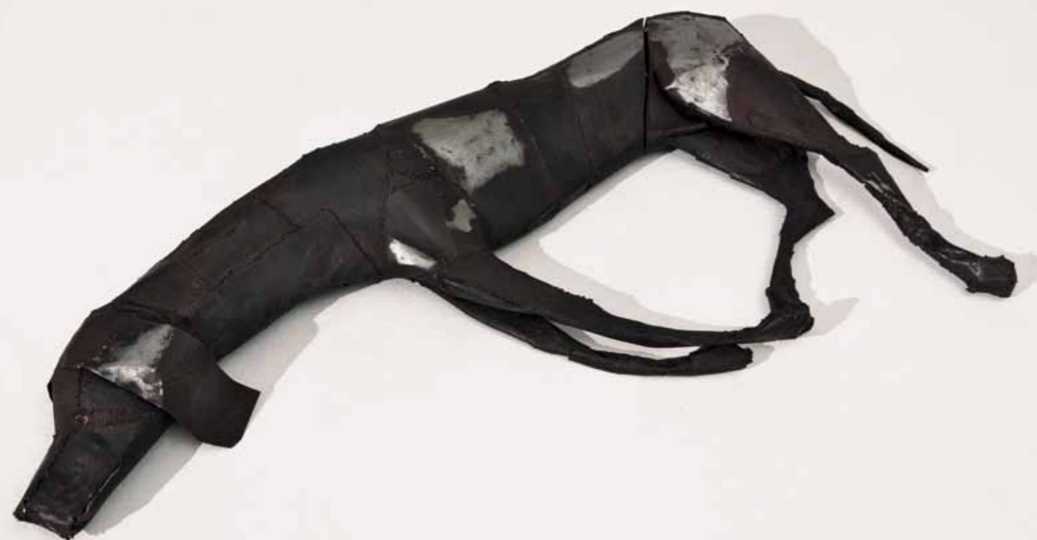
« Bannack », unique, iron and sheet, 17 x 71,5 x 138,5 cm, 2008.